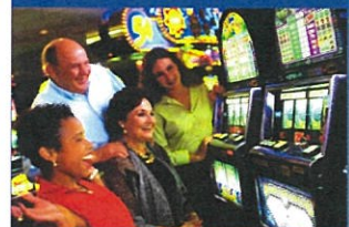
Give Lady Luck a Spin!

Departure: Council on Aging, 335 West Society Ave, Albany, GA @ 8 am