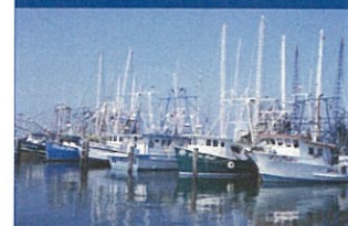
The Beautiful Gulf Coast Awaits