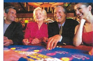
First Class Gaming